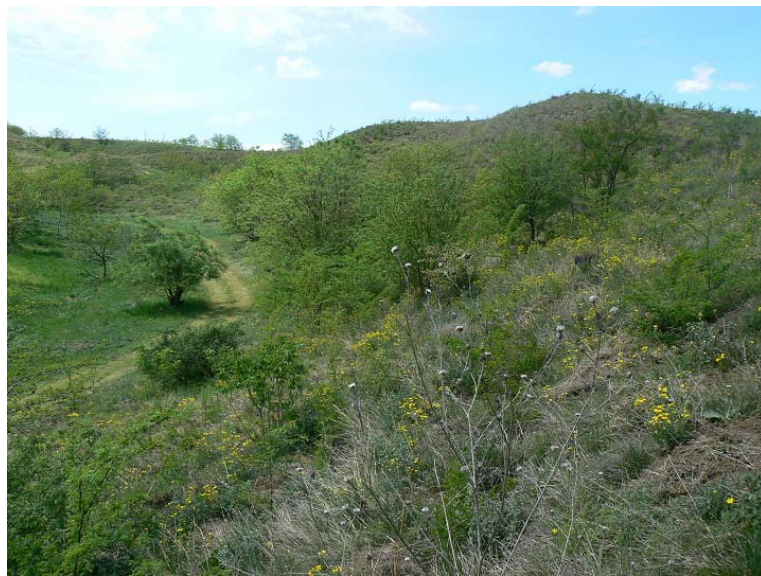
Figure no.3 Habitat of D. caspius in Galati county