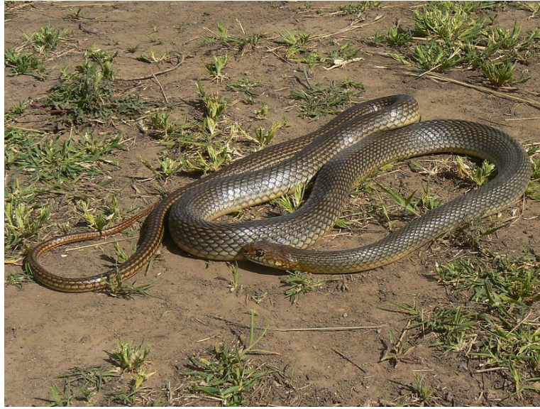
Figure no.2. Adult male D. caspius from Galati county