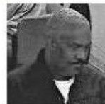
FRAUD Indianapolis, Indiana