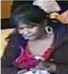
FORGERY Indianapolis, Indiana