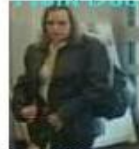
FRAUD Mooresville, Indiana