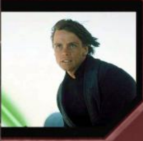
Luke Skywalker, Jedi Knight